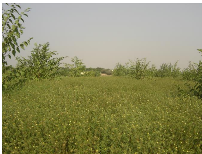
Fig. 1 Luxurious growth of S. seabrana