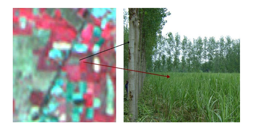
Fig. 3: Poplar boundary plantation appearing in blackish red pixels adjacent to bright red pixels of agriculture crop

R.H. Rizvi, R.S. Yadav, K.D. Kaushik and I.A. Khan National Research Centre for Agroforestry, Jhansi