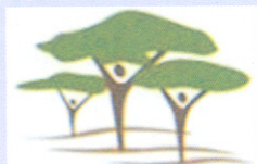
World Agroforestry Centre