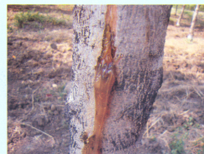
Plate 2. Gum-bead exuded after ethephon application