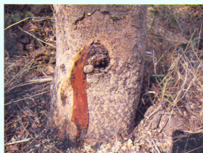
Plate 1. Hole at base of tree-trunk for injecting ethephon solution