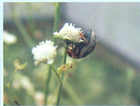
Zygotogramma bicolorata (Mexican beetle) feeding on Parthenium