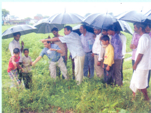
Director, NRCAF, Jhansi demonstrating the release and gifting of Mexican beetle to the farmers