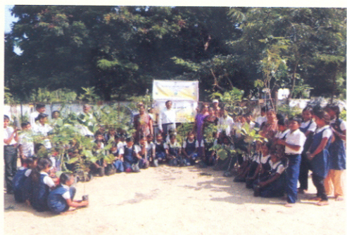
S K Nagar (Gujarat)